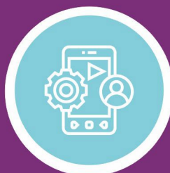
Mobile App Development