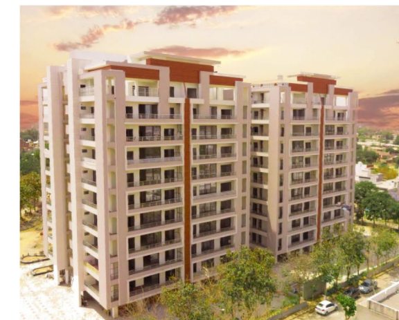
Sheesh Mahal Heights