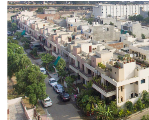
Sheesh Mahal Colony