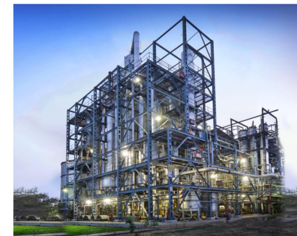
BCL Industries (Distillery Unit)