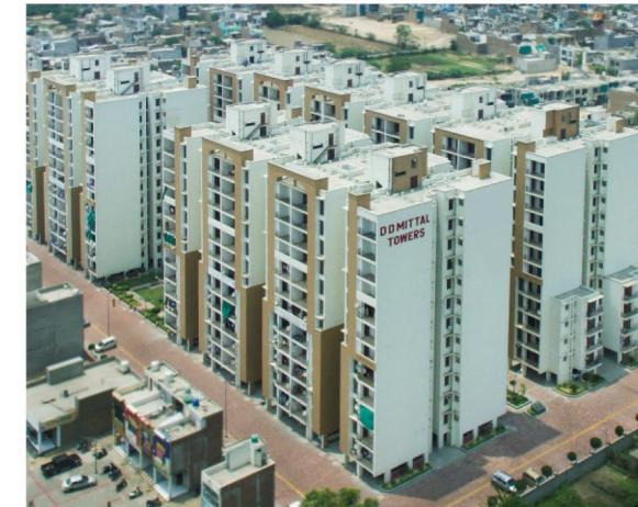
D D Mittal Towers