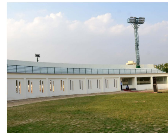
Tulip Club & Stadium