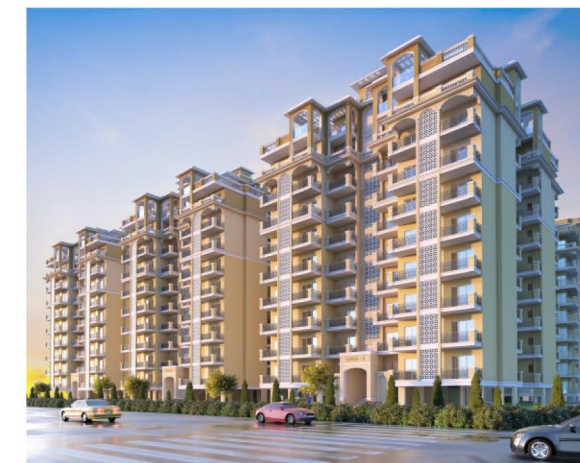
Sheesh Mahal Skyline (Upcoming)