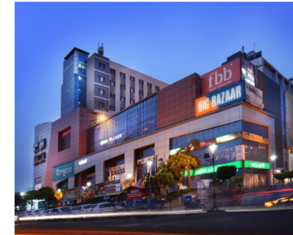
Mittal City Mall